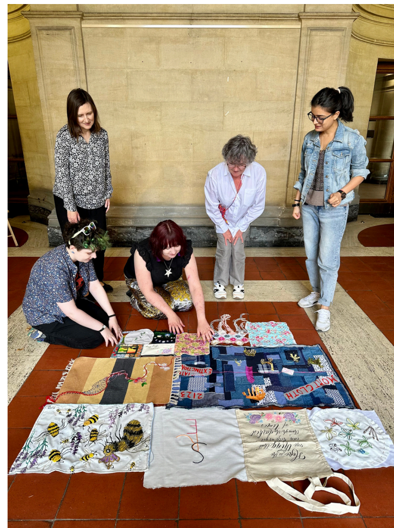
Island Open Studios 2023